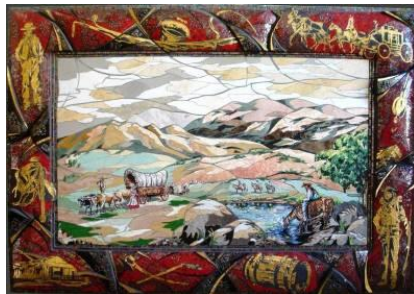
Title: “ The Emigrant Trail ” Size: 7x10 feet. December, 2010.